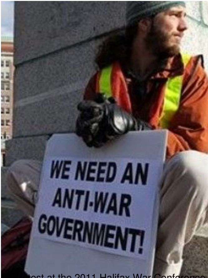
Protest at the 2011 Halifax War Conference

Sunday, 18 November 2012 03:36 - Last Updated Sunday, 18 November 2012 04:09